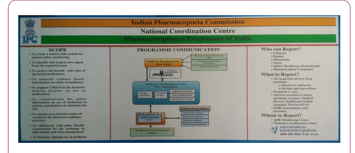
Figure 1 Pharmacovigilance Programme of India - Scope, Communication and ADR Reporting

Pharmacovigilance Programme of India encourages all healthcare professionals and consumers to report ADRs associated with Nutraceuticals. The submitted ADR reports are reviewed and analysed at NCC and finally submitted to World Health Organization - Uppsala Monitoring Centre (WHO-UMC), Sweden. The process of reporting and monitoring of ADRs includes the following (Figure 1).